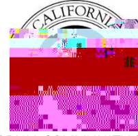
CALIFORNIA COMMUNITY COLLEGES